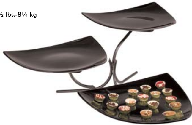
CHART #1 & 3 PAGE 91