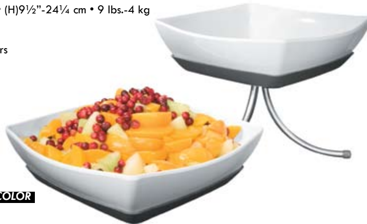
CHART #1 & 3 PAGE 91