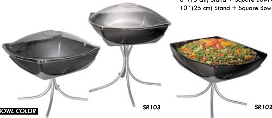
CHART #1 & 3 PAGE 91