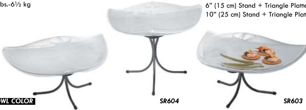
CHART #1 & 3 PAGE 91