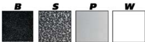
B - Black, S - Silver Vein, P - Platinum, W - White Insert code at end of ORDER #